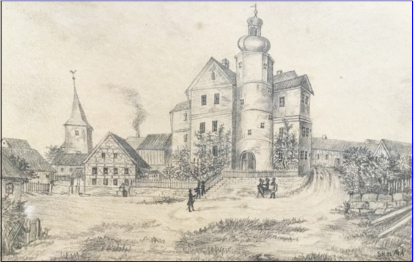
Drawing of 1815 of Castle Untersiemau near Coburg, Germany, where Scharlie's family lived for some generations

As if she wanted me to find her things, when I'm all set, when values shift, when skin gets colourless like pencil drawings and memories defend like castle moats, when hair shows grey like still uncertain years, when houses come and go, when blood delightfully runs slower, not as water runs, for it is thicker, so she said, than water.