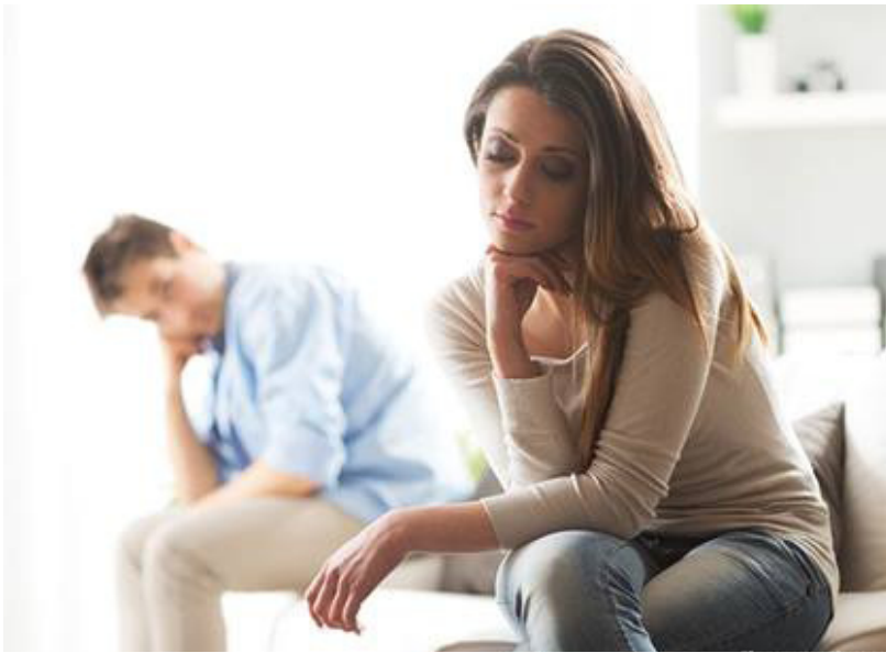
Attributing beliefs and desires to other people

beliefs and desires, which in turn are based on a combination of interdependent factors including their observed actions, past experiences, and genesis. Beliefs and desires are, like emotions, abstract concepts we construct to explain physical actions. They play a significant role in explaining the actions of complex organisms such as humans, but also a significant though arguably less complex role in explaining the actions of other animals.