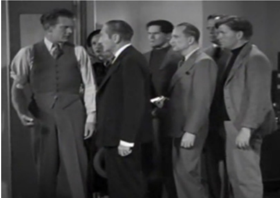
Giving blood under duress

other general desires and other general actions relative to a method of comparing correlations means that: